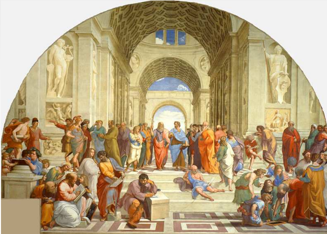
Raffael: The School of Athens (1510-1511)